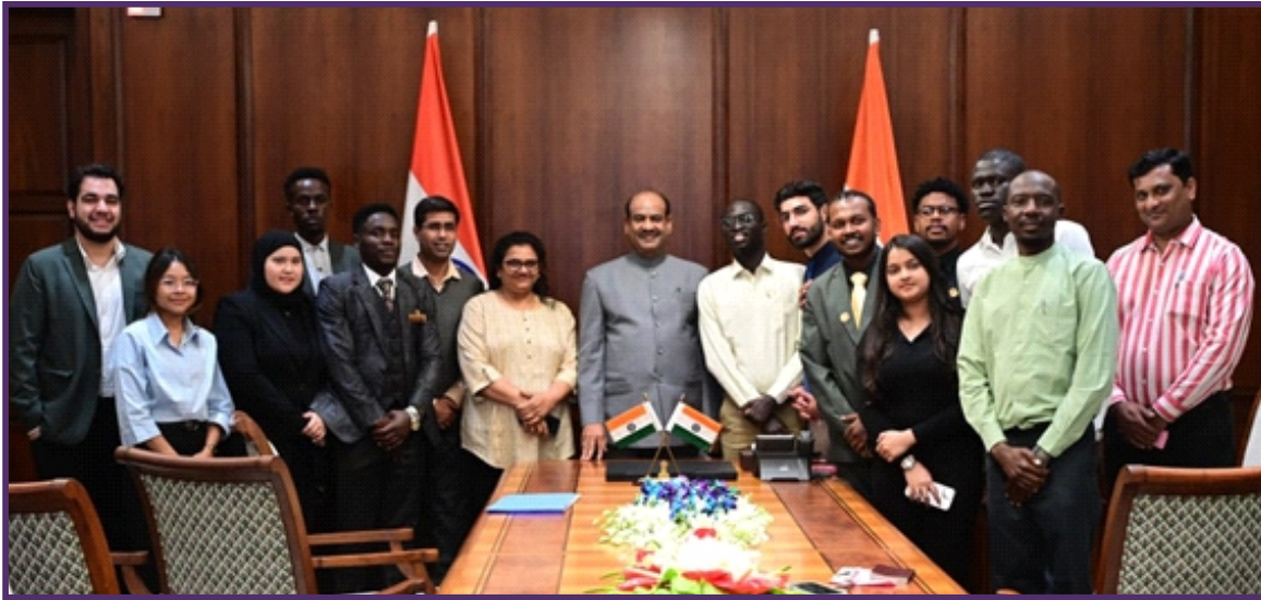
Meeting with the Hon'ble Speaker of the Lok Sabha, Shri Om Birla