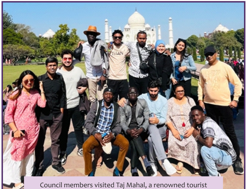
Council members visited Taj Mahal, a renowned tourist attraction in Agra, which is a UNESCO World Heritage site