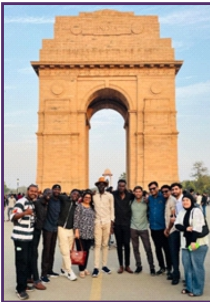
Witnessing the majestic aura of India Gate, a war memorial